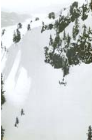
Top portion of Internationale.

From the tree line, we dropped to the valley floor, passing over what would become the top of Chair Three, with a vertical rise of 525 feet. To the north of Internationale were other bowls. The largest I named Great Scott after my firstborn son.