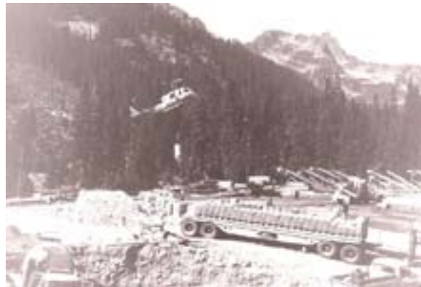
Concrete for lift tower footings.