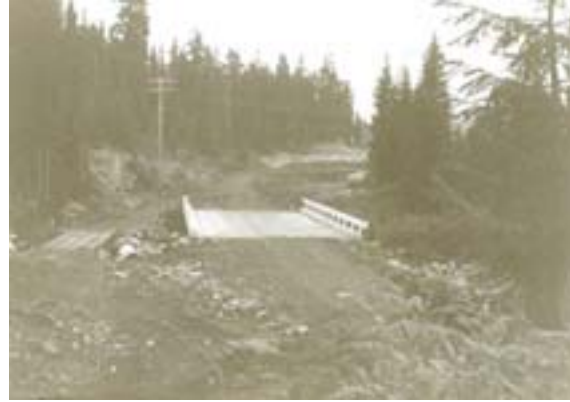
Temporary bridge & completed bridge.

The river was Alpentel's Achilles heel. The churned-up silt, which discolored the river's crystal-clear water, brought daily complaints from downstream. We were inundated by visits from the county, state, and federal protection agencies who wrote citations faster than a used-car salesman could pass out business cards.