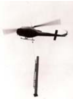
Chairlift tower erection.(1967)

After the timber was off the lift line, Tommy Gurr started setting towers onto the reinforced concrete pads. I watched his first placement. With a tower dangling from a cable, the Sikorsky hovered while two men below struggled to place the swinging tower over four bolts imbedded in concrete that protruded from a two-foot-square steel-base plate. The tower was finally jerry-rigged into place, like threading a needle, and nuts were quickly screwed onto the bolts.