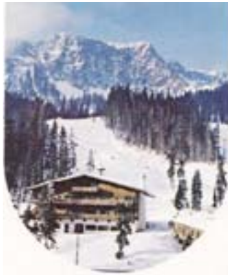
Alpentel day lodge (1968).